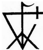
Toppes' merchant's mark

As to his business, in most records he is referred to as a mercer, rather than a merchant, as this was the occupation given when he bought the 'freedom' of the city in 1421/22, that is the right to trade. Mercers originally dealt in small luxury goods, such as brooches, silks and buttons, but by this time they formed an elite both in London and in Norwich, where nearly half of all mayors of the city in the 15th century were mercers. All merchants or mercers had their own merchant's mark to label their goods and to use as a seal on deeds.